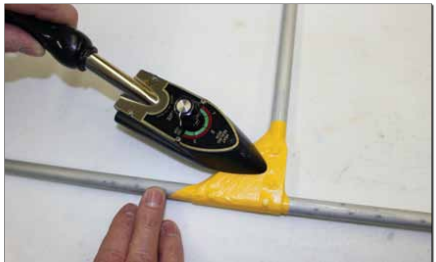
Fig. 3: Cut a patch of adhesive-coated fabric about a quarter-inch larger than the object to be covered and iron it into place.

The actual iron setting needed to get the glue to 158° F will vary depending on