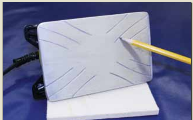
The channels in the T14's baseplate can catch on rivet heads and gusset edges, damaging the Oratex color layer.