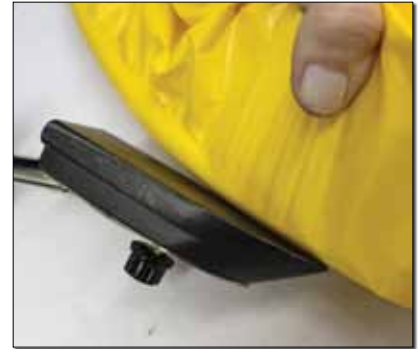
Fig. 6: On curved sections, pull the fabric with one hand while ironing it with the other.

the heat sink properties of the underlying material. With aluminum structure (the worst-case heat sink), we found an iron setting of 300 to 350° F worked well. There is no concern about burning or melting the fabric. The maximum application temperature is 392° F, and Oratex doesn't actually melt until 482° F.