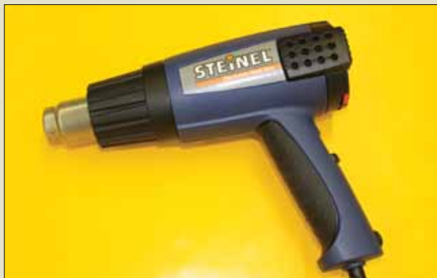
The Steinel HE2010E heat gun provides full digital control of output temperature, ranging from 120° F to 1150° F, in 10° F increments.

Everyone liked the Toko iron, but we found it had two drawbacks when applying Oratex to riveted aluminum structure. The baseplate incorporates channels with sharp edges intended to help spread ski wax. The channels tend to catch on protrusions like rivet heads and