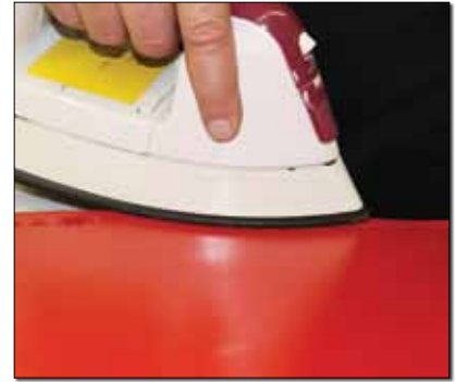
Fig. 9: When heat is applied to the center of the tape, it stretches enough to allow the non-heated, and now shorter, edges to lie down. They can be smoothed with an iron.

then brush on the adhesive and pull the tape while it is still wet. When the adhesive has dried, position the fabric and tack it with the iron along the straight sections. Trim to the desired overlap and iron down those sections. Now start pulling the fabric around the curved sections with one hand while ironing it with the other (Fig. 6).