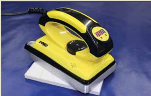
This Toko T14 digital iron was originally intended for applying wax to skis and snowboards. Its primary feature is extremely accurate temperature control.

A digital iron like the T14 controls temperature with a micro-processor rather than a thermostat. It has no low and high ON-OFF