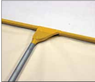
Fig. 5: This is how a completed section looks; it's important to go slow, apply pressure to the iron, and heat every square inch.