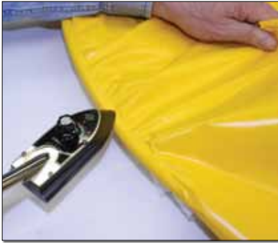
Fig. 7: With enough effort and heat, the fabric can be wrapped around compound shapes without puckering.