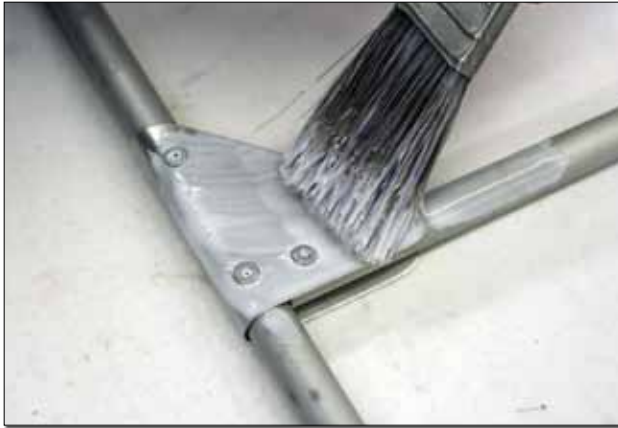
Fig. 1: After a thorough cleaning, scuff the parts to be covered with a mild abrasive, then apply Oratex adhesive with a brush.